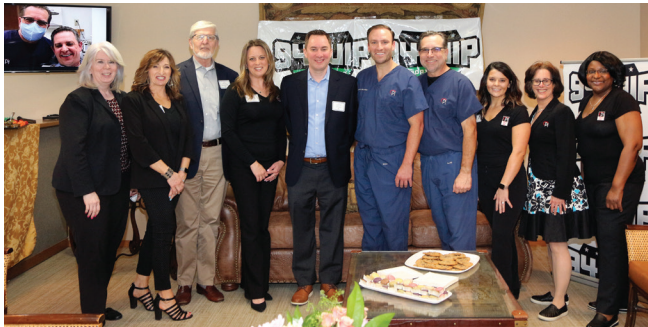
During NPAW, Pi Dental Center in Fort Washington, PA, hosted an open house with tours, dental education, and prizes.