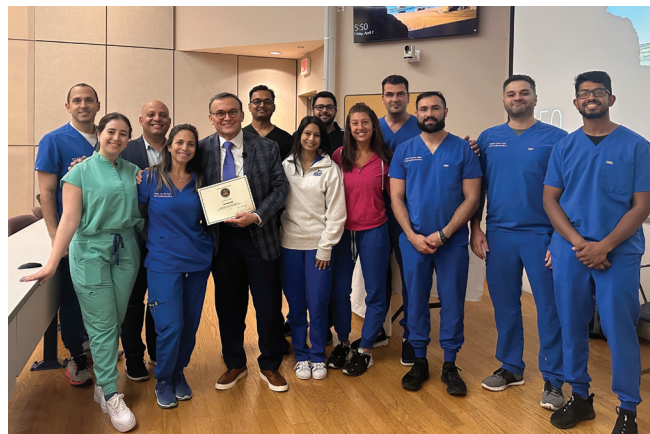
Nova Southeastern University held events throughout the month of April in celebration of prosthodontics and in conjunction with National Prosthodontics Awareness Week!

“To us, inspiration is about creating a culture where everyone feels valued, supported, and empowered to be their best selves. Inspired by the American College of Prosthodontists National Prosthodontics Awareness Week, we organized a full month of activities in April to increase awareness of the specialty to predoctoral students. By including our faculty, residents, colleagues and students we like to create a sense of belonging, which allows us to unlock the full potential of prosthodontics and open our door to future colleagues.”