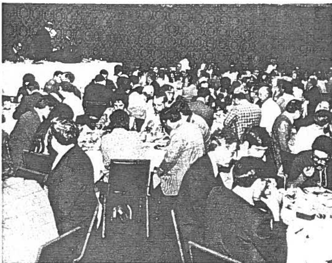
A portion of the crowd attending the annual business meeting luncheon.