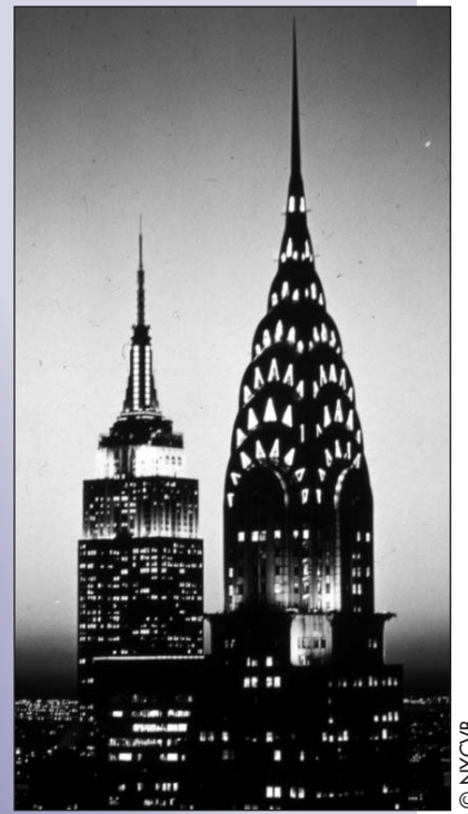
Empire State & Chrysler Bldgs