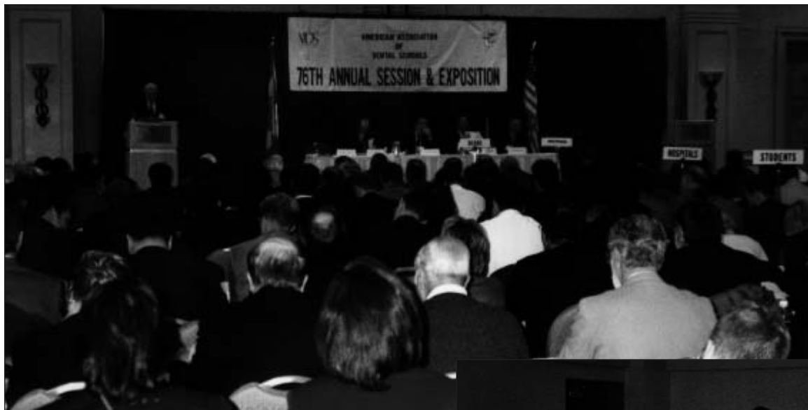
Opening Session of the AADS House of Delegates.