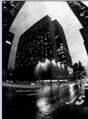
New York Hilton and Towers