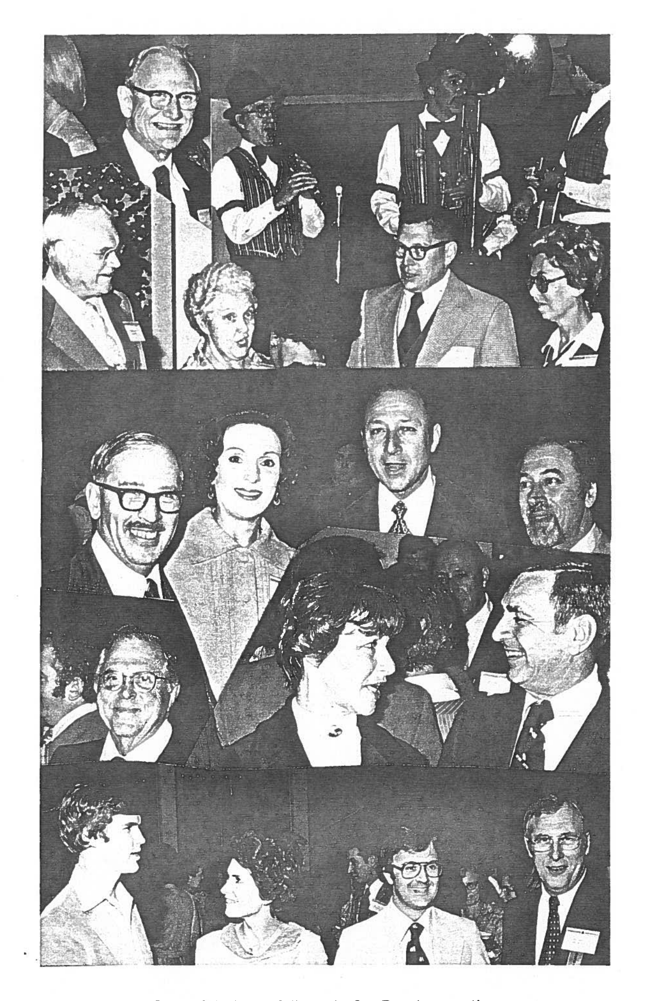
Some of the happy folks at the San Francisco meeting.