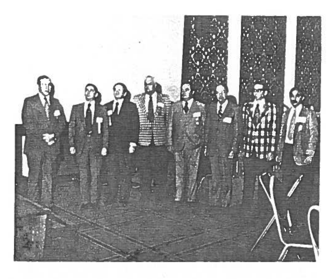
Elected officials present for installation appear above complete list elsewhere in this newsletter.