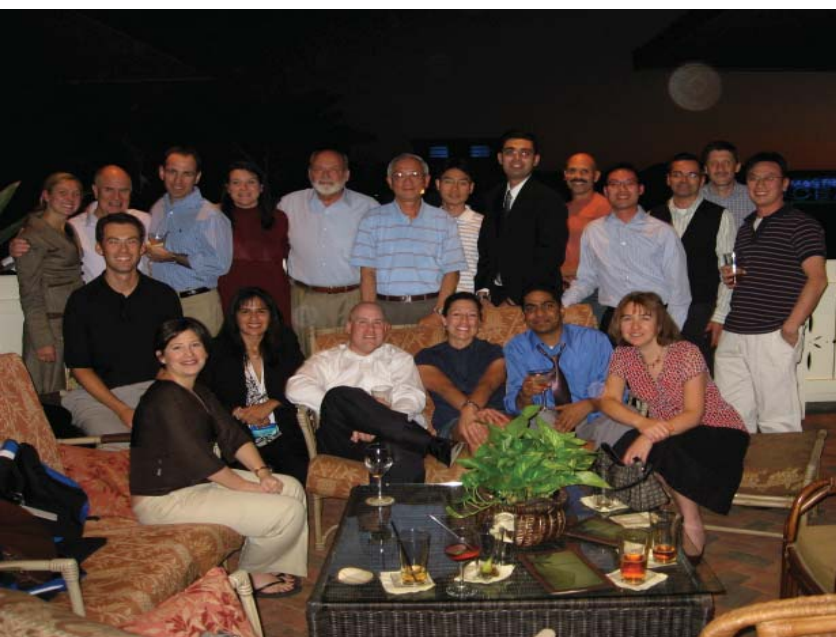
UConn residents meet at the ACP's 2007 Annual Session in Scottsdale, Arizona

and hold regular treatment planning seminars together. This has been beneficial to both specialty programs. The Prosthodontic residents run a multidisciplinary seminar at the school that includes treatment planning and discussion between all specialties.