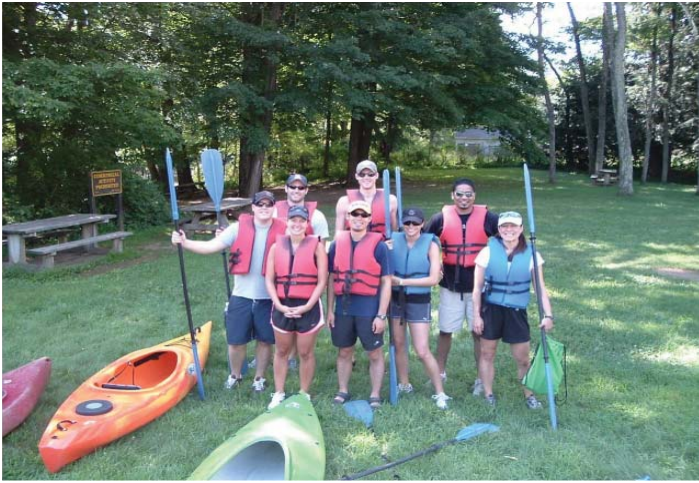
Prior to our annual trip down the Farmington River in 2007.